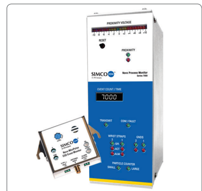
Embeddable Process and ESD Monitoring