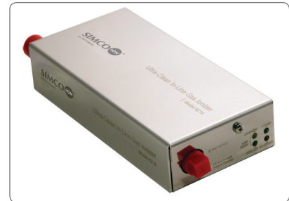
In-line Ultra-clean 99.999% Nitrogen Ionizer