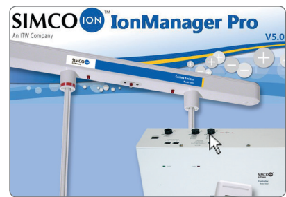
Room Ionization System