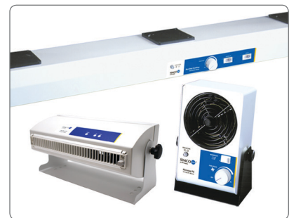
Ionizing Blowers for Device Protection in Test and Assembly