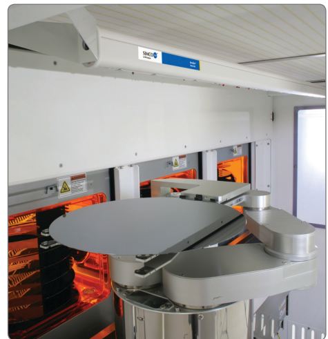
The industry-standard Digital AeroBar system provides balanced, optimized ionization inside tools and mini-environments.

The Model 5635M Metal-free AeroBar MP provides the same performance for wet-clean and CMP tools where the presence of metals may adversely affect processes and yields. In tight areas where space is limited, the tiny QuadBar™ Ionizers Models 4630/4635 deliver ionization at close distances.