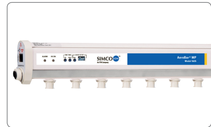
Ultra-clean AeroBar® for Extended ISO Class 1

In test, assembly and packaging areas, benchtop blowers Model AeroStat PC and wide coverage Model AeroStat XC2 provide protection at the workbench. Overhead Blowers Guardian and CR2000 models protect products from above the workbench or table, providing large area coverage. The lightweight, ergonomic Ionizing Guns Model 6115 AirForce Gun and the Top Gun provides handheld blow-off ionization. For voltage sensitive applications, Critical Environment Blower models provide ionization at 3V and down to 1V when used with a Novx monitor.